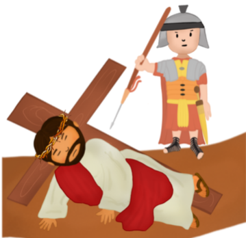
Jesus falls the third time