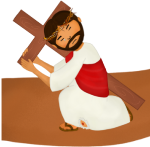
Jesus falls the second time