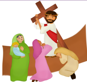
Jesus meets the women