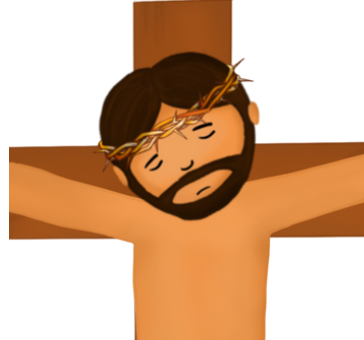
Jesus dies on the cross